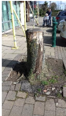
This tree was cut down well over a year ago. Would that happen in Solihull Town?

3.3.3. The village centre needs to be radically changed to make it a “go to location” rather than a place that one has to go to. It needs to be the heart of the community as happens in other successful towns e.g. (Knowle, Dorridge, Dickins Heath, Solihull). That will require a radical approach and significant investment in the public realm and a commitment to better ongoing maintenance. The failure to positively maintain the public realm makes the centre a poor cousin to Dickins Heath, Knowle or Dorridge. Two photo examples are shown below. At two recent litter picks, residents brought shovels to clear the road gutters on the central roundabout of years of accumulated earth/muck. This is not centre that will attract top class establishments in its current state.