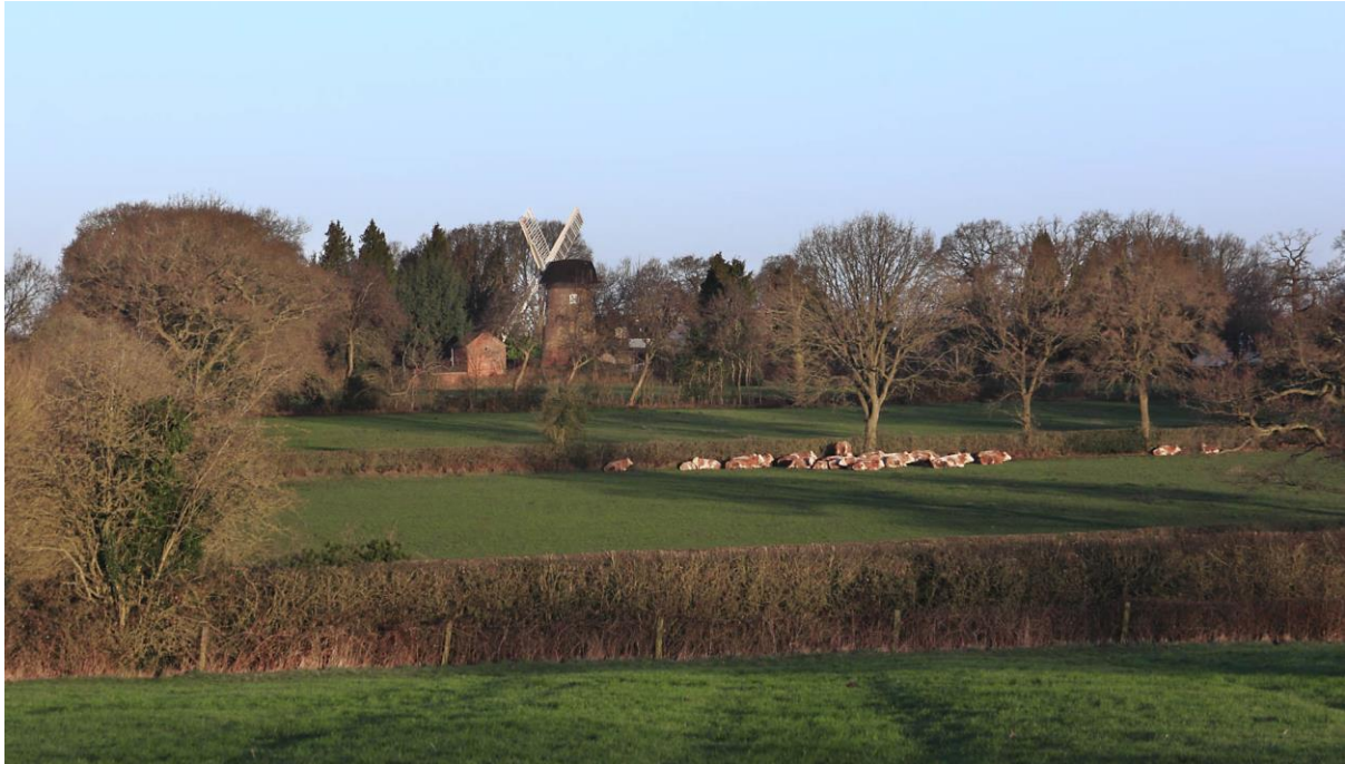
View across land proposed for removing from green belt south of Waste lane