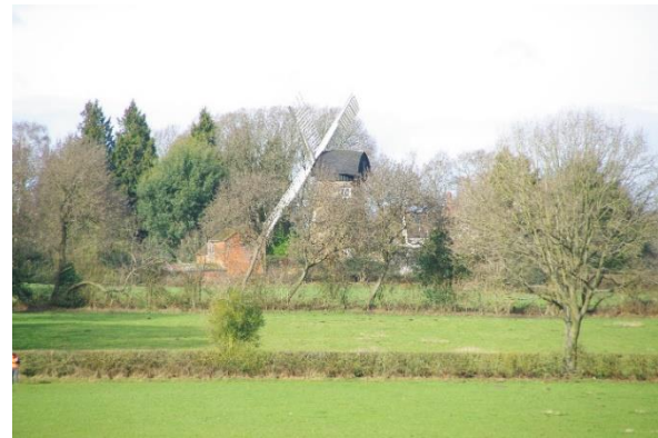
The setting of the Mill from the south east from footpath grid reference 254756 (path M184)