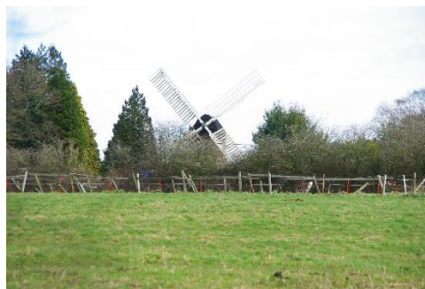
The Windmill from the Kenilworth Road grid ref 246 756