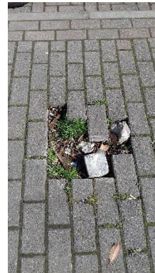
This pavement has been like this for a long time and is next to the tree with wheelchairs forced to go over it