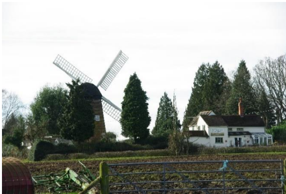
The setting of the Mill from Hob Lane - grid reference 250 761