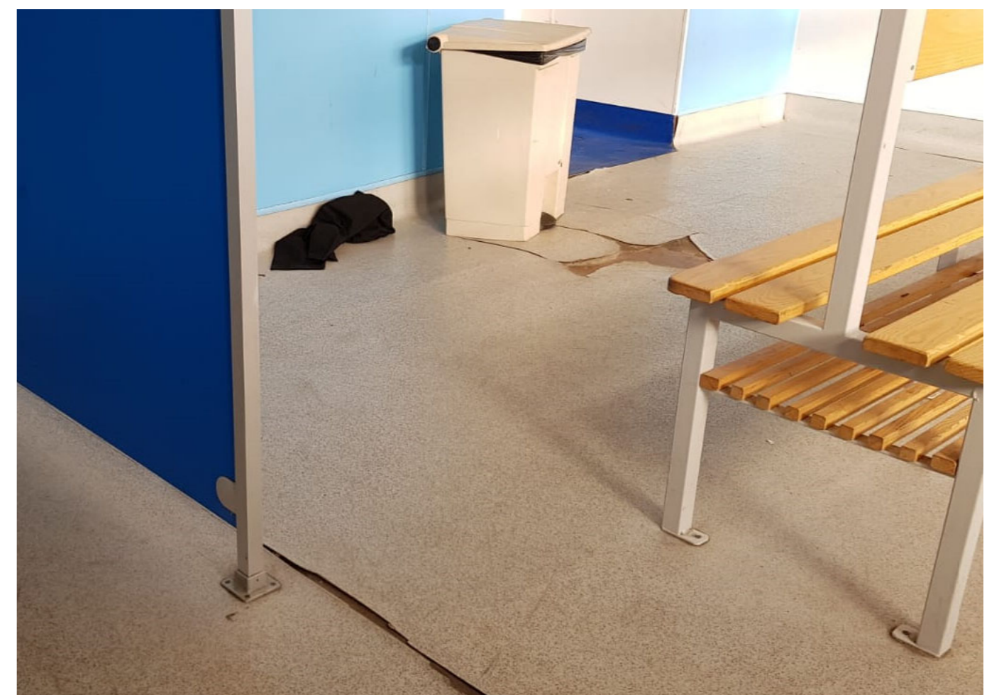
Existing changing facilities