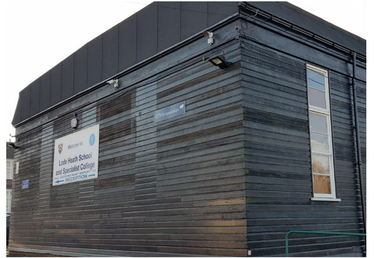
Existing gymnasium exterior