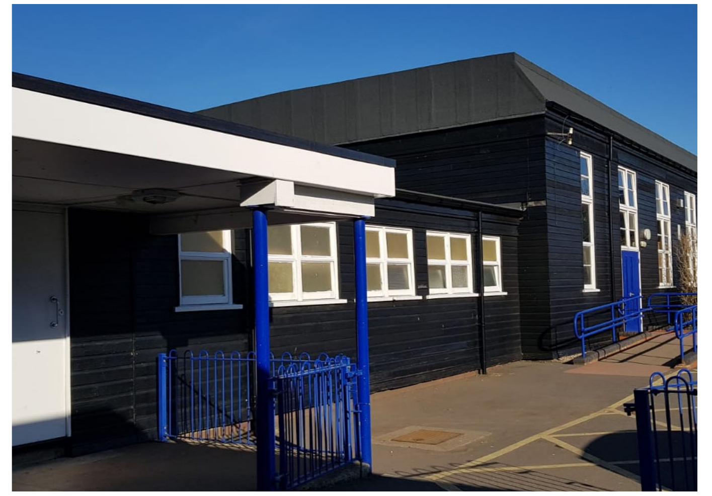
Existing gymnasium exterior