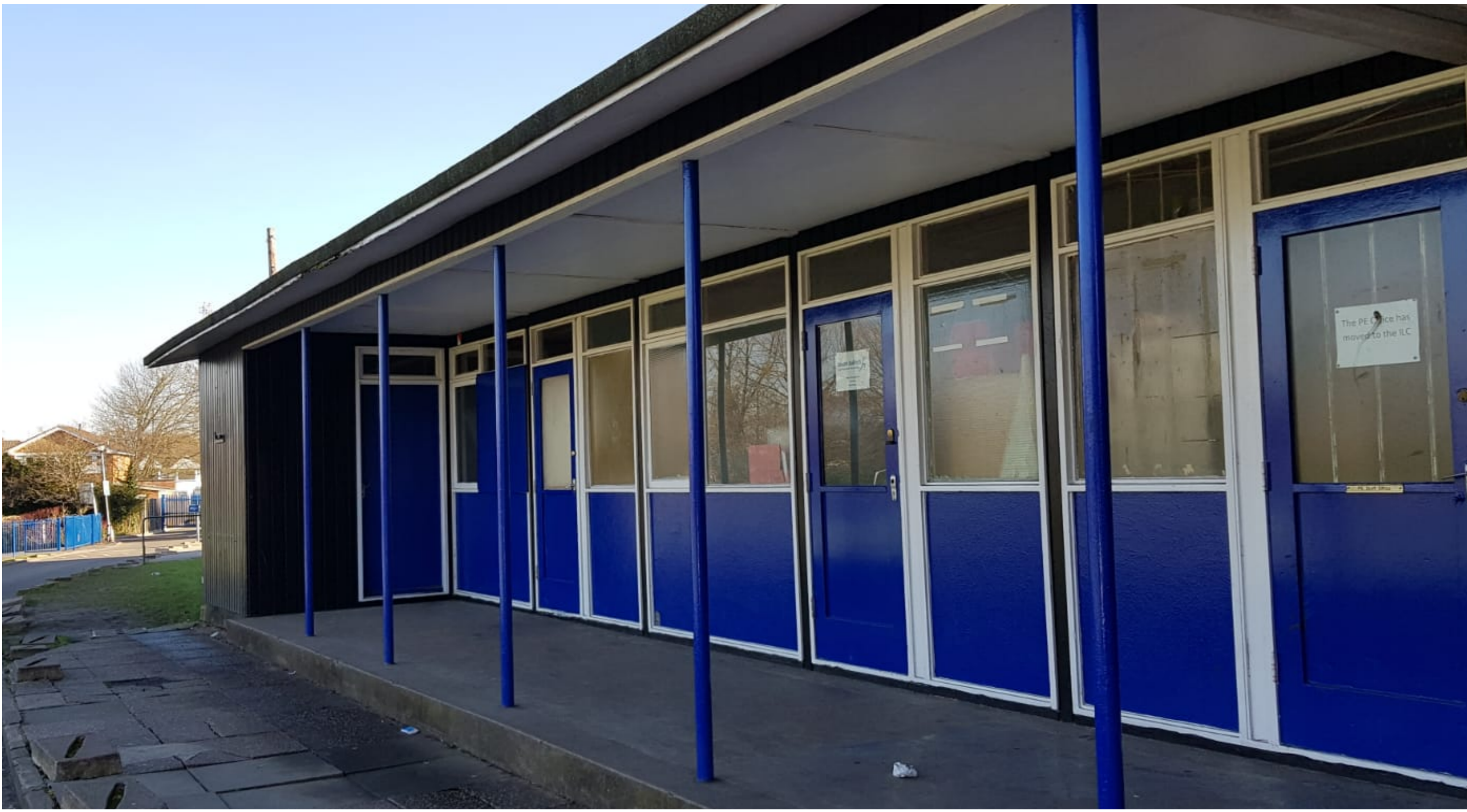
Existing gymnasium exterior