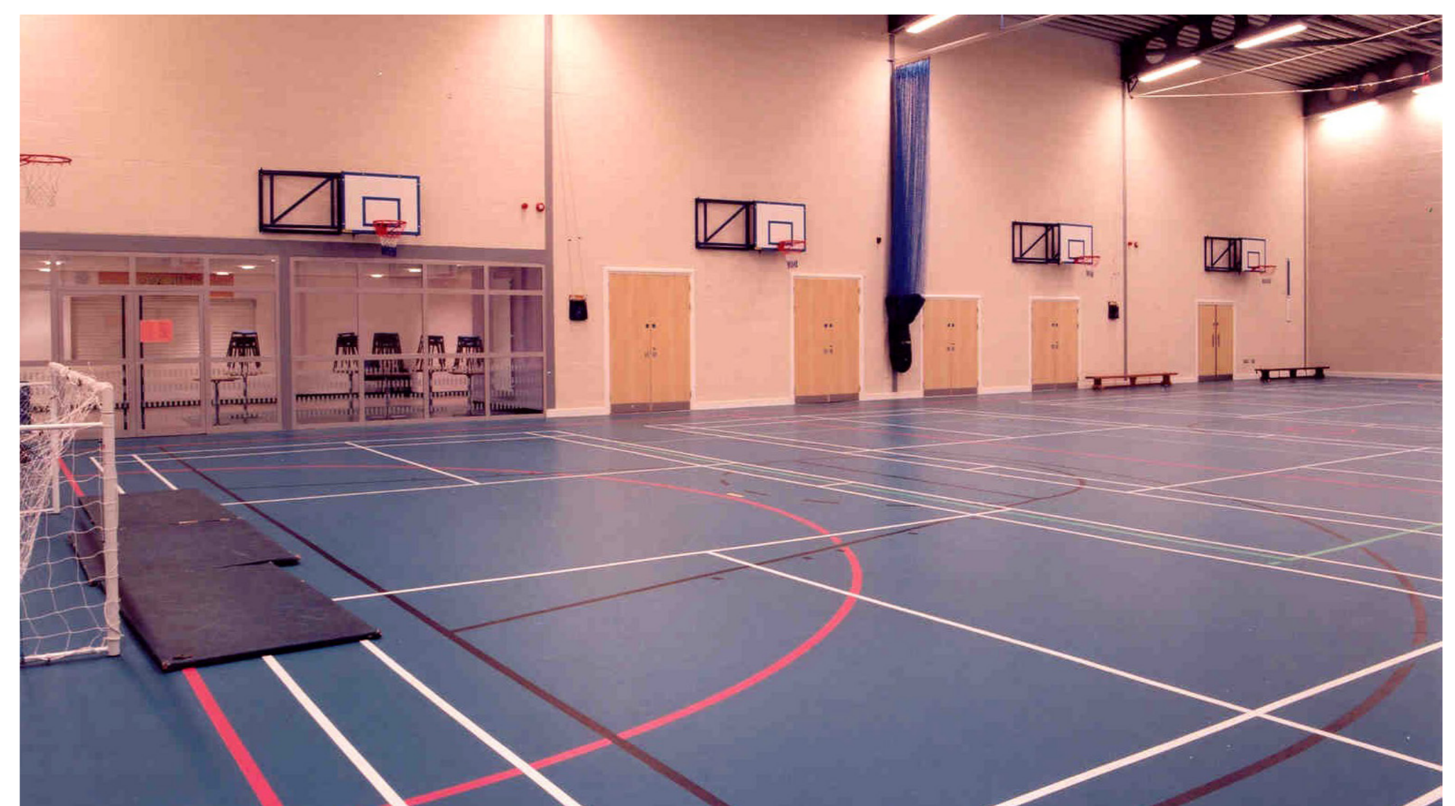
Example of gymnasium interior