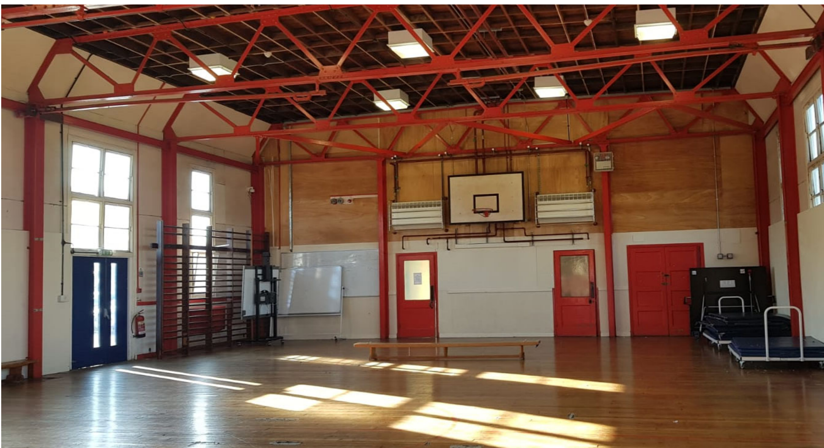
Existing gymnasium interior