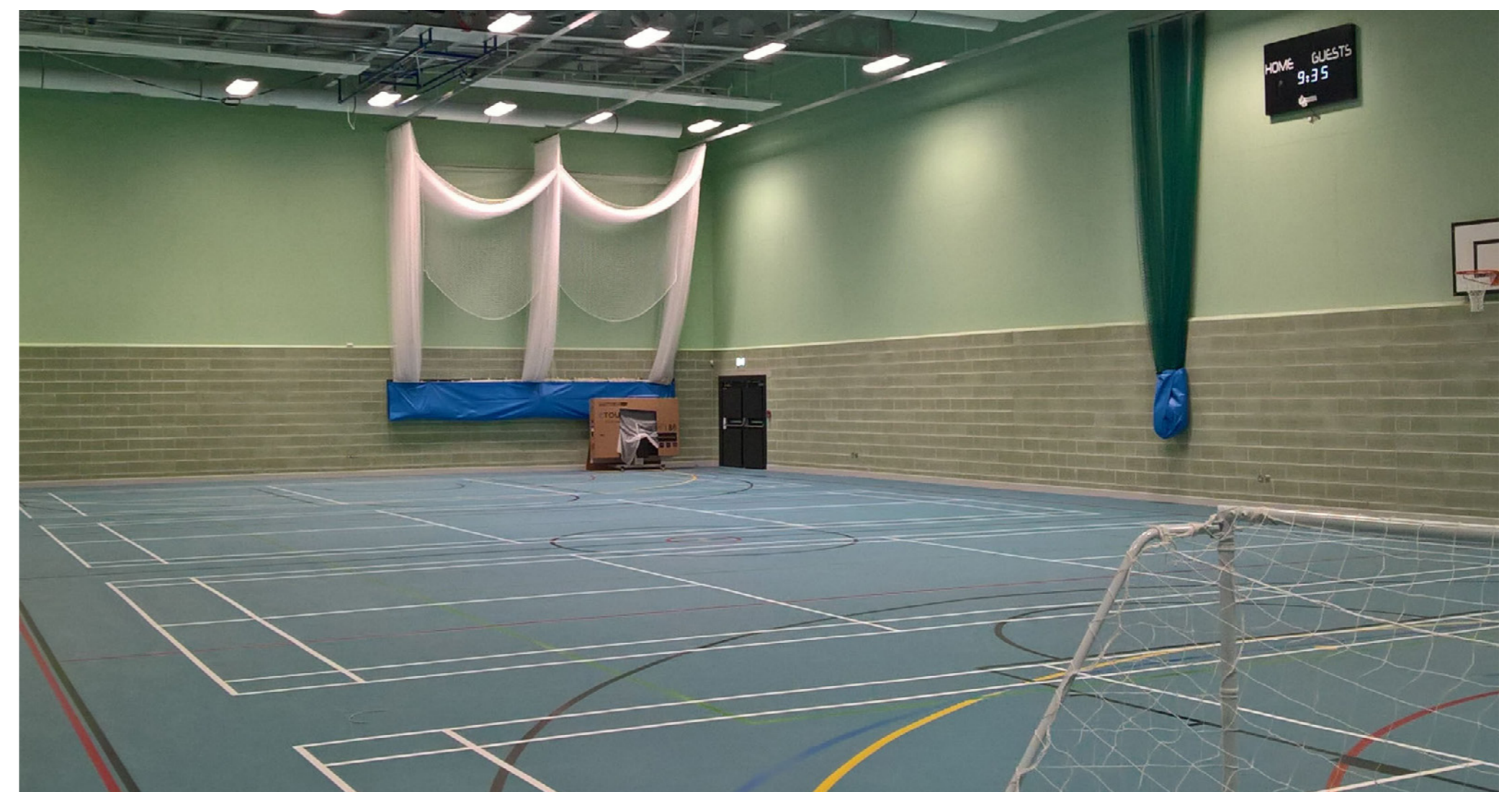
Example of gymnasium interior