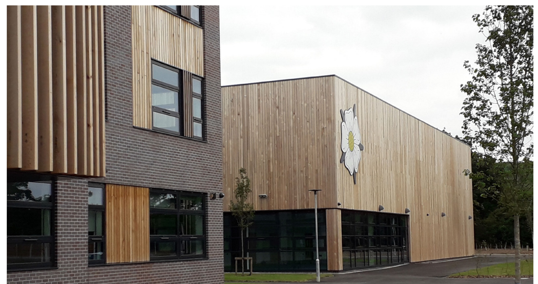
Example of gymnasium exterior