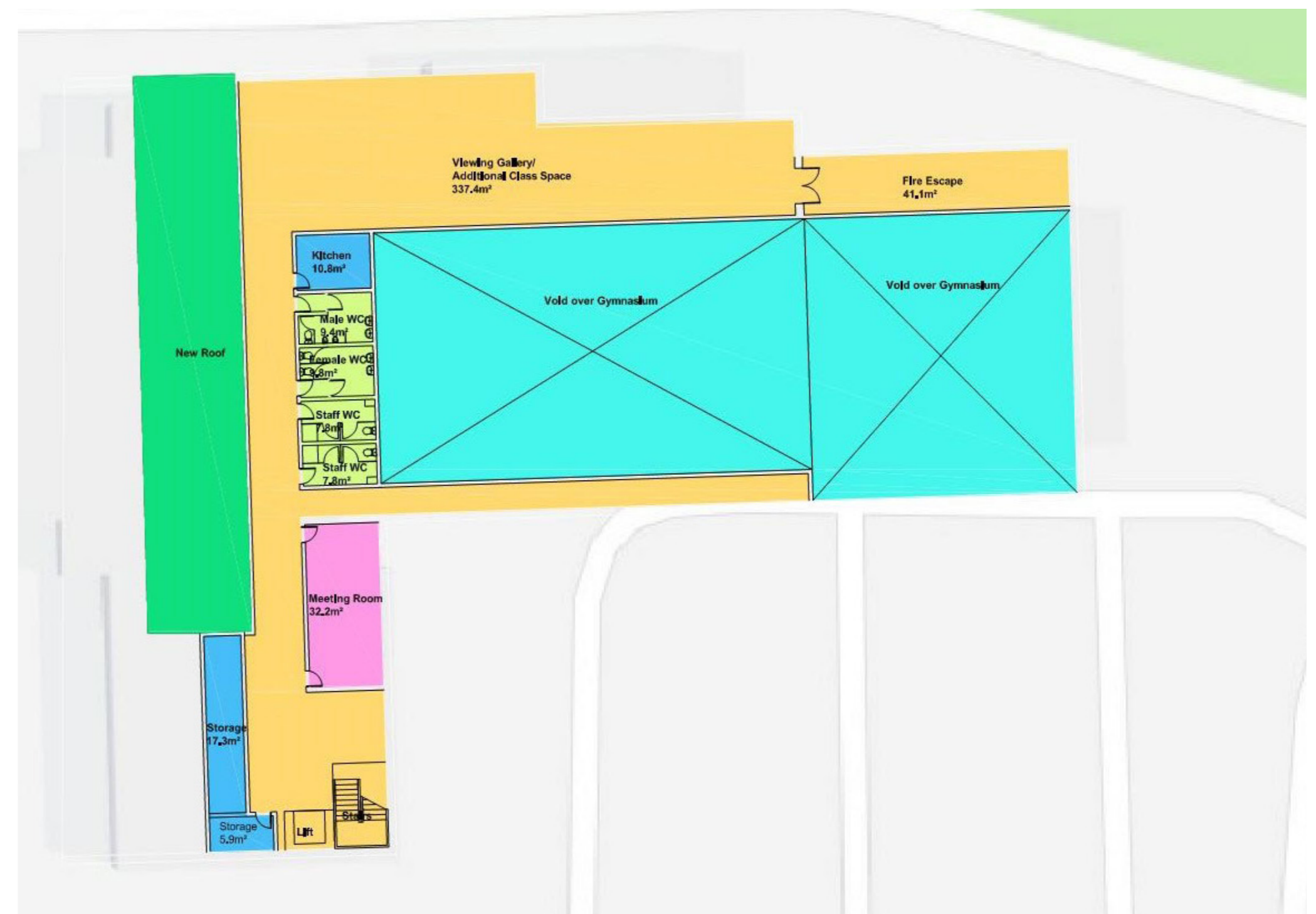
Indicative First Floor Plan