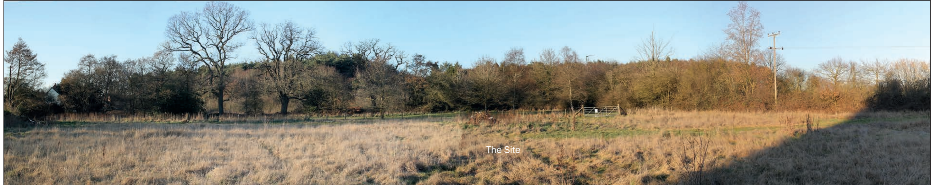
Photo Location 1: View of strong northern boundary planting at Hampton Lane.