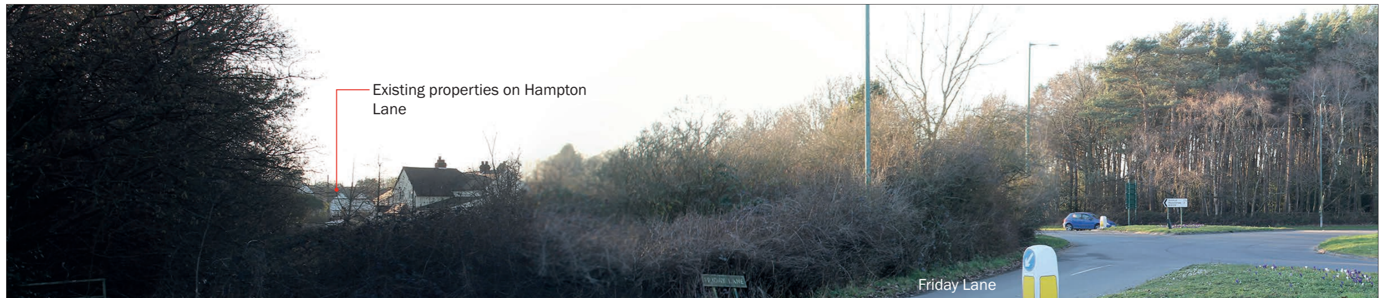
Photo Location 6: View of intersection between existing development on Hampton Lane and Friday Lane.