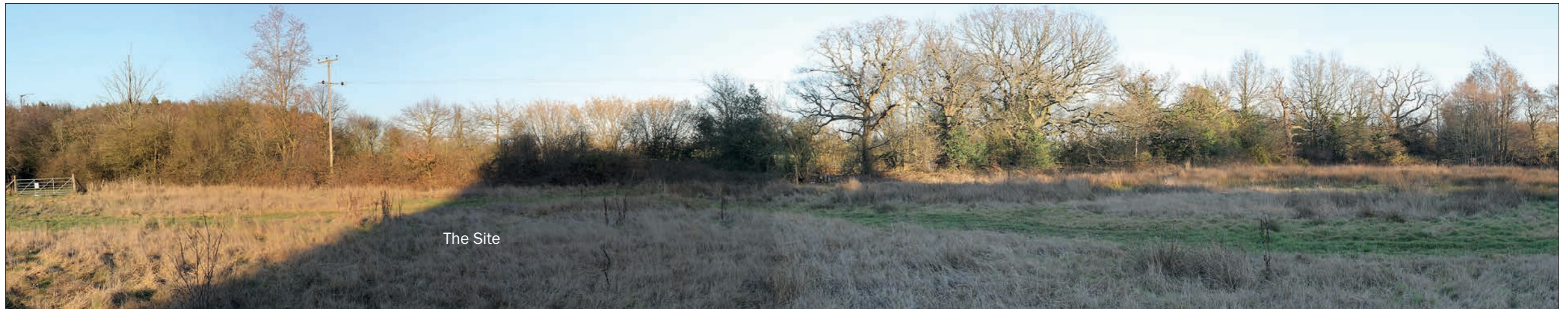
Photo Location 2: View of strong eastern boundary planting at Friday Lane.