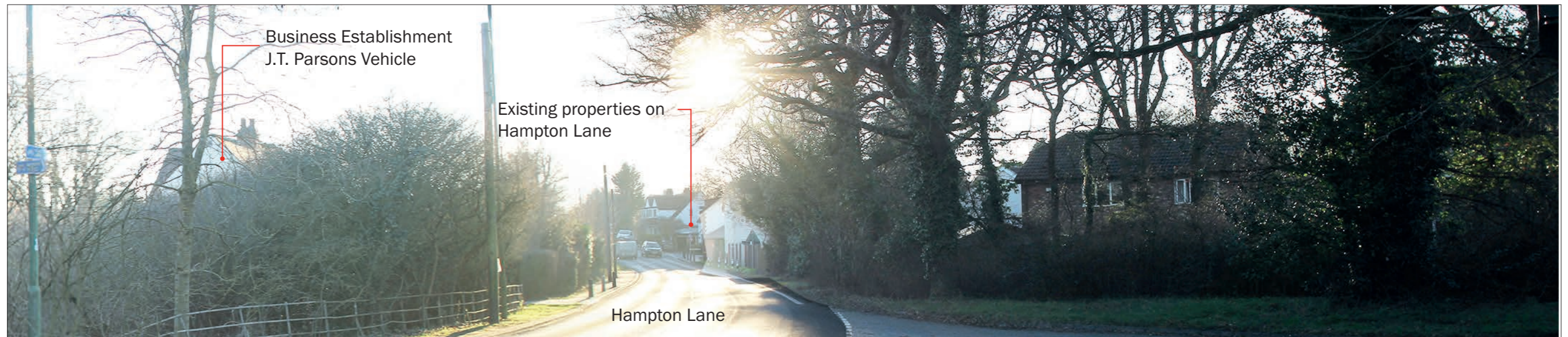
Photo Location 7: View west on Hampton Lane towards the existing properties located at the north of the site.