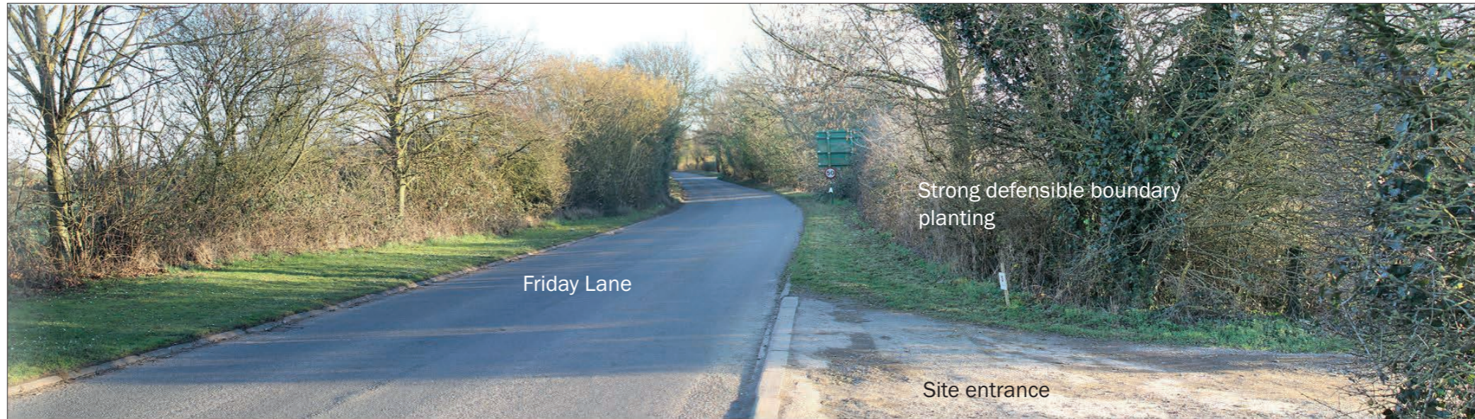
Photo Location 5: View of strong defensive Green Belt on Friday Lane.