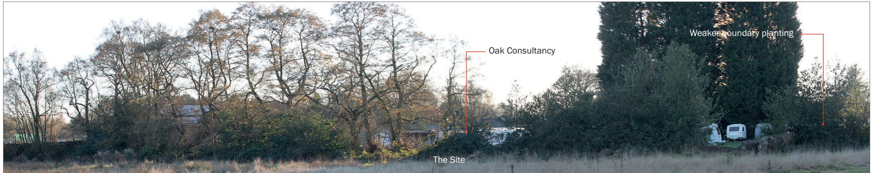
Photo Location 4: View west towards weaker Green Belt boundary and existing developments.