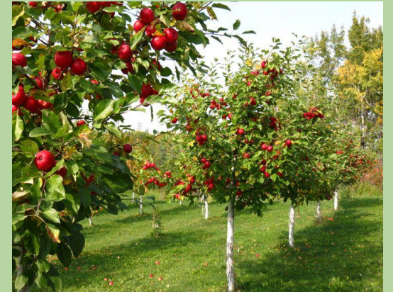
Orchard and Fruit trees