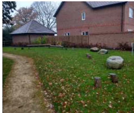
The neighbourhood play area on Meers Stones (there are 2 such features next to the A452 and this photo shows half the area.)