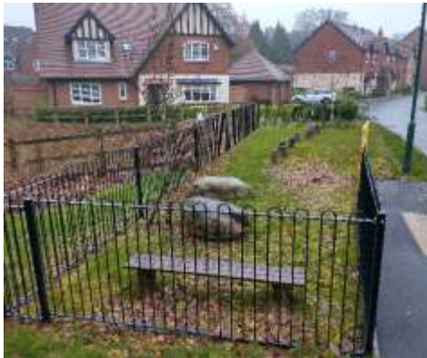
The neighbourhood play area on Drovers Close